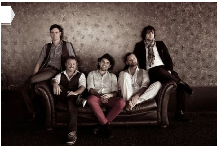
The Lamplights are appearing at the Highfields Christmas Block Party.

POPULAR Australian band The Lamplights are appearing as special guest performers at the annual Highfields Christmas Block Party.